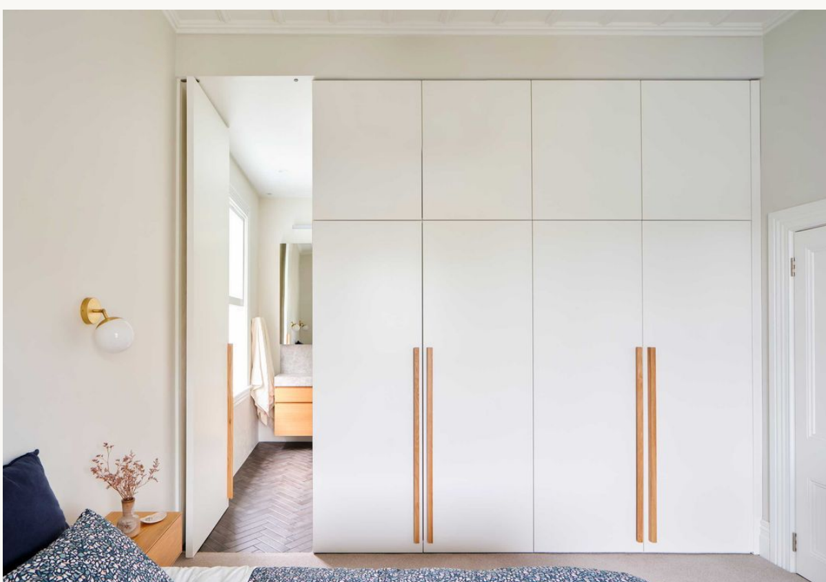
A wall of storage using Blum Clip Top hinges is spacious and efficient. The ensuite replaces a room previously used as a study.

Bathroom Project Partner Content Here + Blum